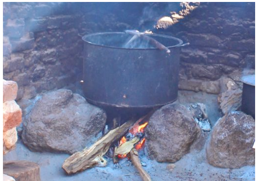
Stove for the past 7 years