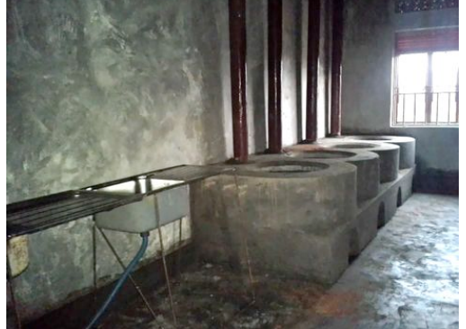
Our brand new kitchen and stove